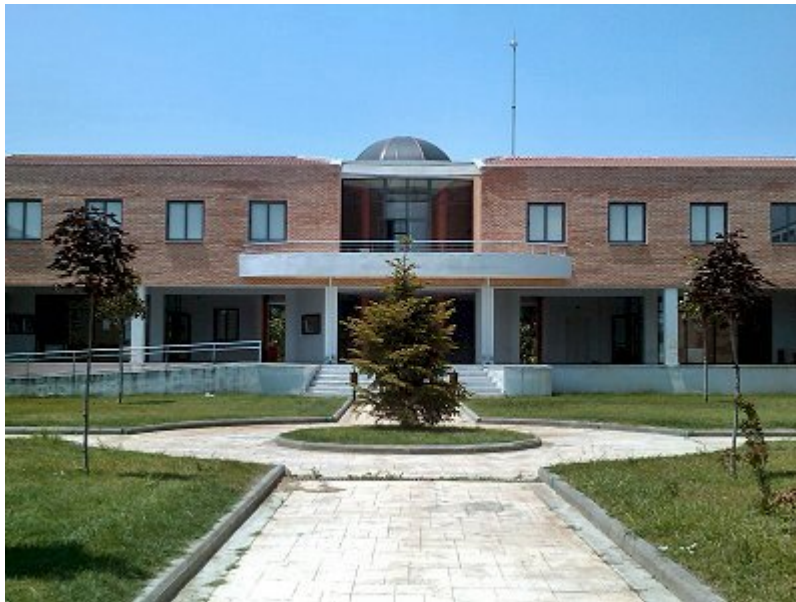
Figure 2. View of the Department's building

The Department offers three Postgraduate Studies Programs (PSP), awarding respectively a Postgraduate Degree in: